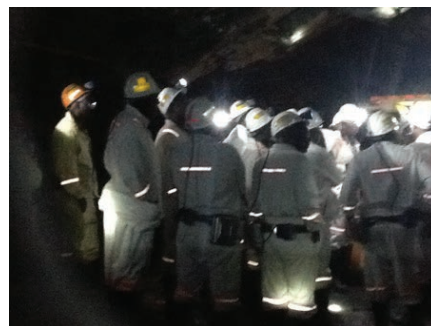
Zimplats Management Team ensuring a safer future for Miners.